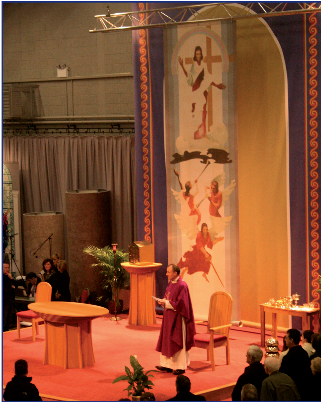
One of the early Masses at St. Mel's Cathedral Centre.