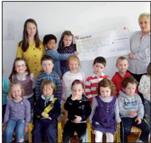
Kids Paradise Creche have great fun raising funds for Make-A-Wish Foundation