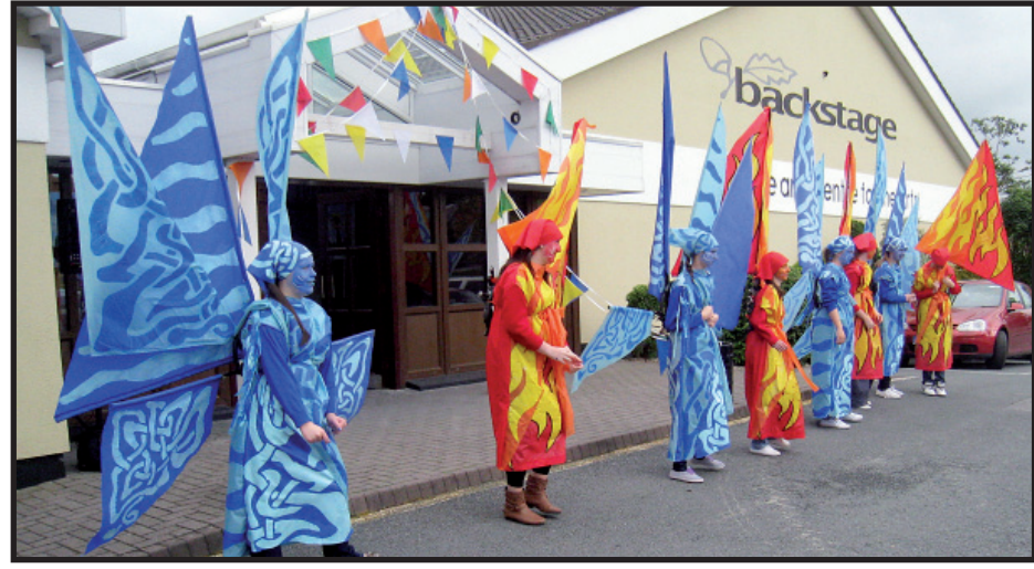
Pictured celebrating Aisling Children's Arts Festival 2010.