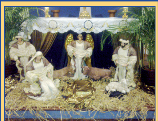
Crib, St. Mel's College Chapel 2010

We wish everyone a blessed Christmas, thank all those who have supported us during the last twelve months and invite you to come and join with us in the New Year.