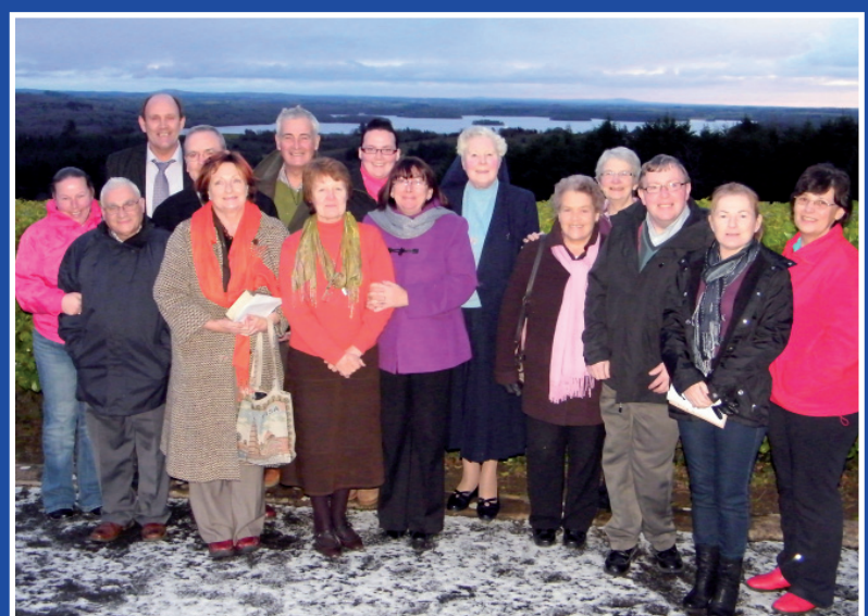
Longford Prayer Group members on their annual retreat in Boyle recently with two of the Sisters from the Galilee Community Prayer Centre.

Membership: If you are interested in joining, contact teabhba@gmail.com or phone 043 3348821. Annual membership is only €15 for an individual, €25 for family. Life membership is €150.