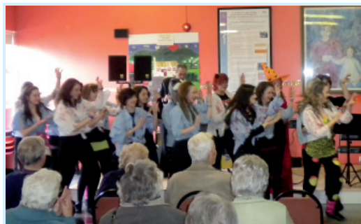
Picture shows some of the Transition Year Students from Mean Scoil Mhuire performing in the St. Joseph's Halloween Party.