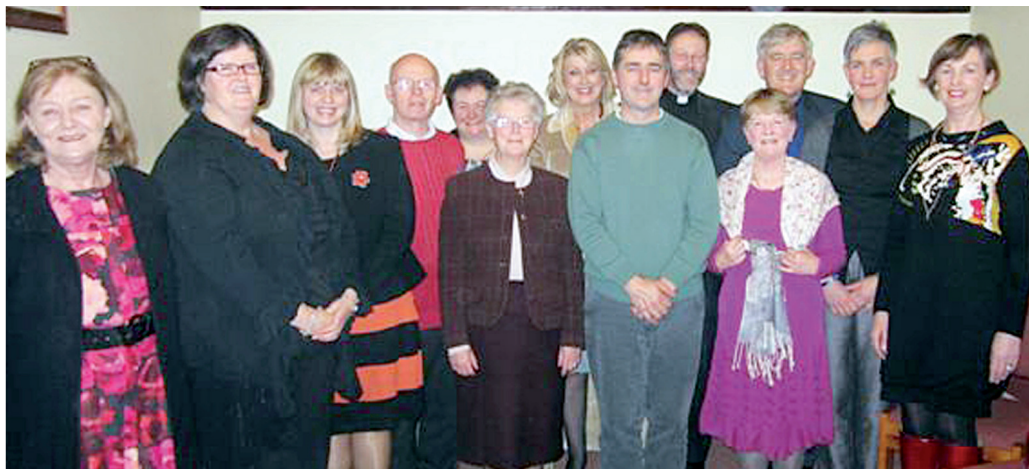
Pictured are members of Longford ACCORD group.

Societal trends have changed dramatically over the past 10 years. In February, the Department of